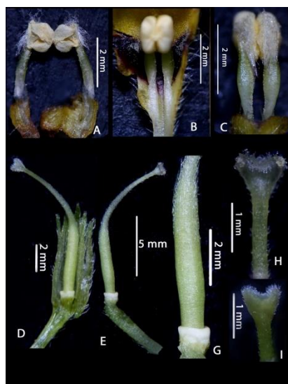
Figure 3. Morphology of Microchirita bimaculata 's stamens and pistil

A-C. filament straight, anther pubescent; D. calyx opened, pistil; E. pistil; G. disk at the base of ovary; H-I. style and stigma